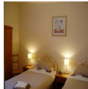
Twin or Double

All rooms are light and airy and tastefully decorated in neutral colours